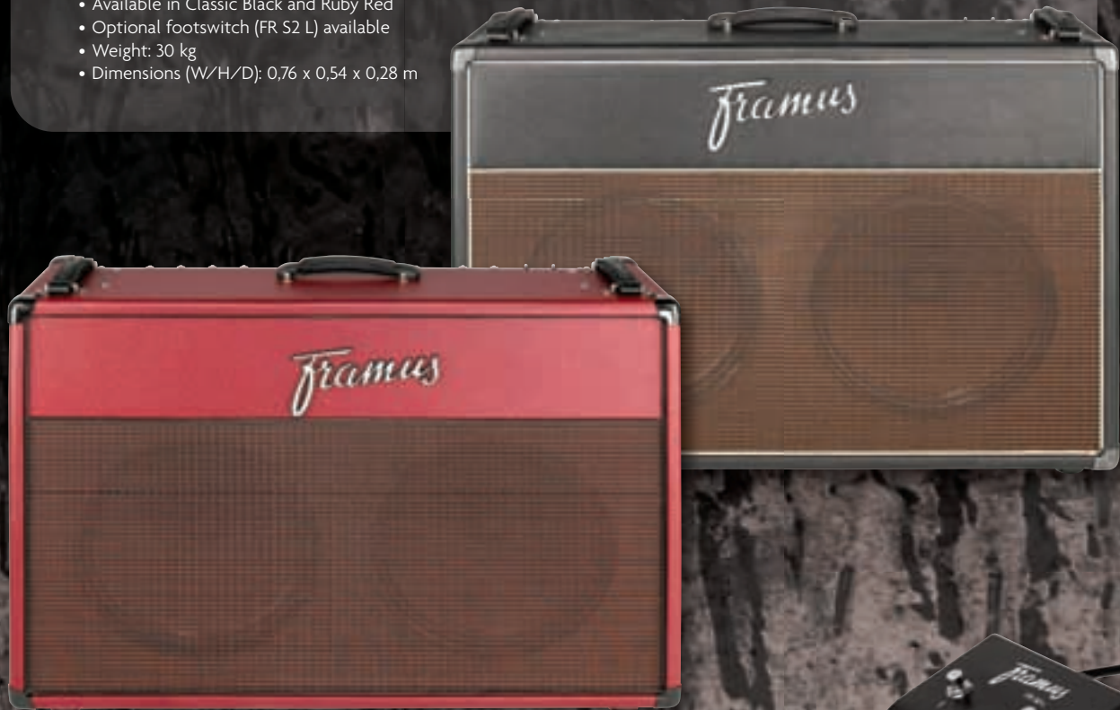
Optional footswitch (FR S2 L)