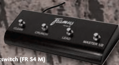
Optional footswitch (FR S4 M)