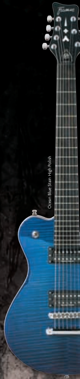
Ocean Blue Stain High Polish