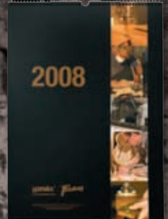
Framus/Warwick calendar 2008

The complete assortment is available at http://shop.framus.de