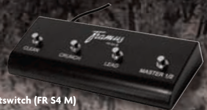
Optional footswitch (FR S4 M)