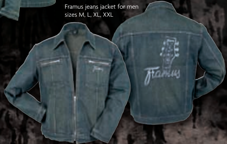
Framus jeans jacket for men sizes M, L, XL, XXL