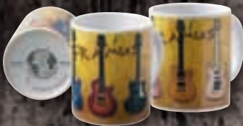
Framus coffee cups