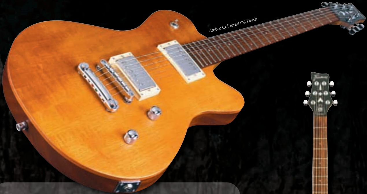
Amber Coloured Oil Finish