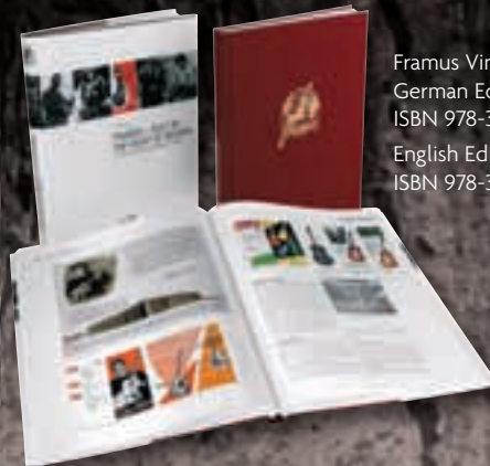
Framus Vintage book, 192 pages German Edition ISBN 978-3-940448-00-2 English Edition ISBN 978-3-940448-01-9