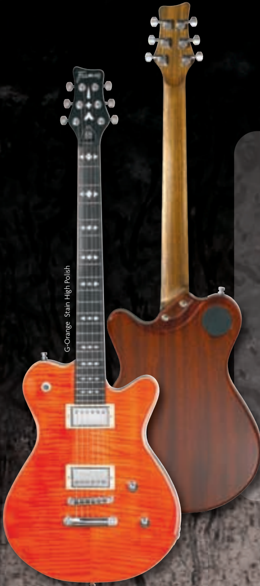
G-Orange Stain High Polish