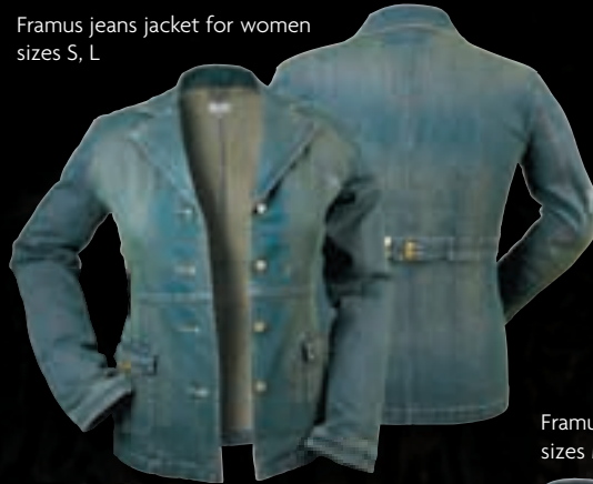
Framus jeans jacket for women sizes S, L