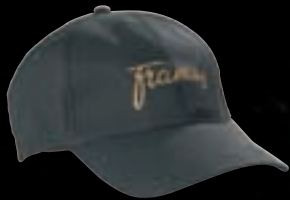
Baseball cap with Framus logo