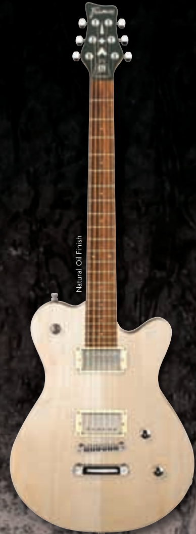
Natural Oil Finish