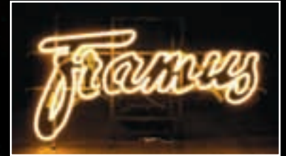
Framus neon light