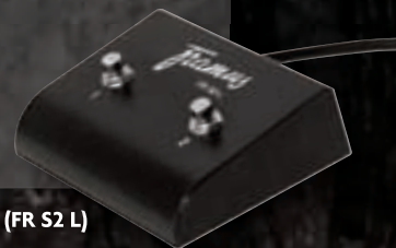
Optional footswitch (FR S2 L)