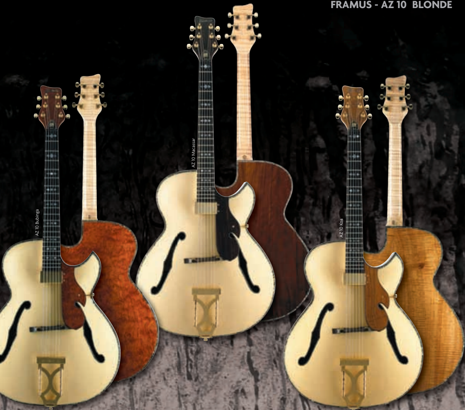
AZ 10 Bubinga